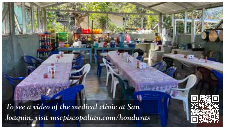
To see a video of the medical clinic at San Joaquin, visit msepiscopal.com/honduras